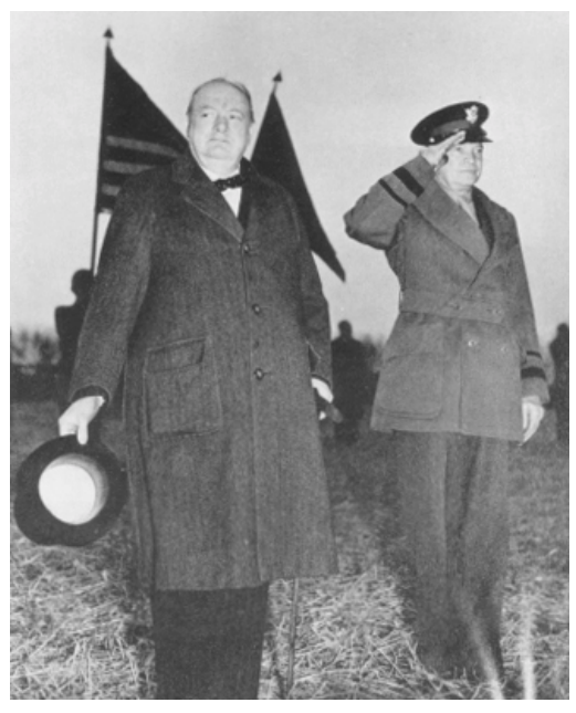
Winston Churchill used tears and tantrums to get his way with Eisenhower, to no avail.

His code of honour was extraordinarily rigorous. Just before the end of the war a U.S. Army trainload of German prisoners of war was being shipped across Germany. Upon its arrival at its destination, the doors were opened and it was found that 130 of the prisoners had been suffocated to death in the jam-packed boxcars through inadequate ventilation. Eisenhower ordered a complete investigation by the Inspector General. Four days later he asked the American legation in Berne to forward his apology – of all unheard-of things – to the German high command. "If it is found that United States personnel were guilty of negligence," said his message, "appropriate action will be taken with respect to them. The Supreme Commander profoundly regrets this incident and has taken steps to prevent its recurrence."