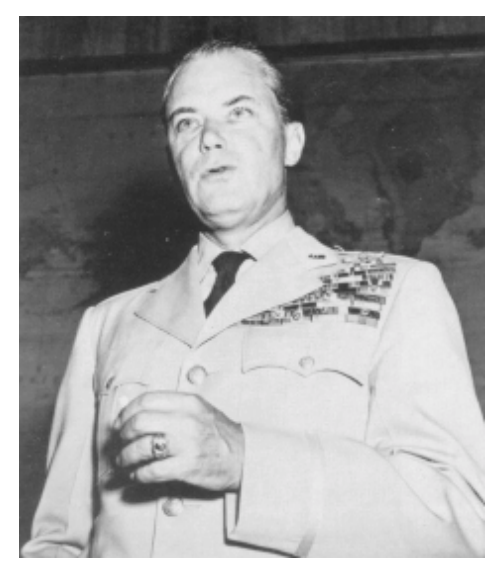
The American titans, clockwise from upper left: Army Air Force generals Hoyt Vandenberg and Carl Spaatz, Ernest King of the Navy, and the Army's "Hap" Arnold. Together, they commanded eleven million men.